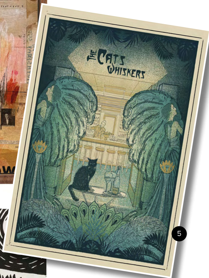
5 The Cat’s Whiskers by Jon Mackay , a Cotswolds-based printmaker best known for his posters for music tours and festivals, is an edition of 40, signed and numbered, with five artist proofs. £95 (unframed) jonmackay.bigcartel.com